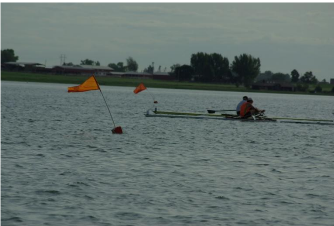
Photo Finish in Men’s singles.