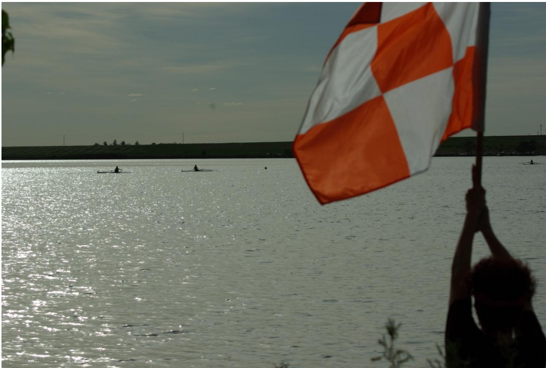
Flags up on the finishers, Saturday, June 5

This is RMRC's fourth year to host our very own regatta and it gets better every year. This season, the regatta was held at Union Reservoir in Longmont, Colorado and was co-hosted by the Longmont Sculling Club.