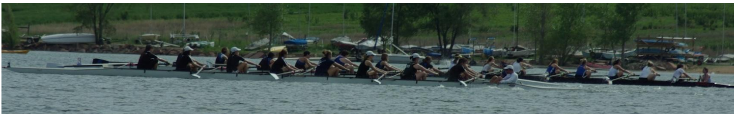
Fighting it out in 8s.